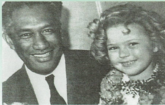
Duke poses with Shirley Temple. He appeared in 19 Hollywood films and documentaries.